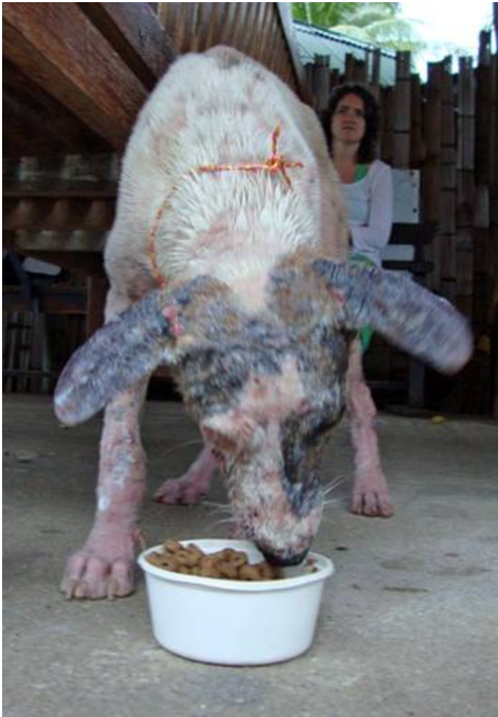
.....2 weeks later.....