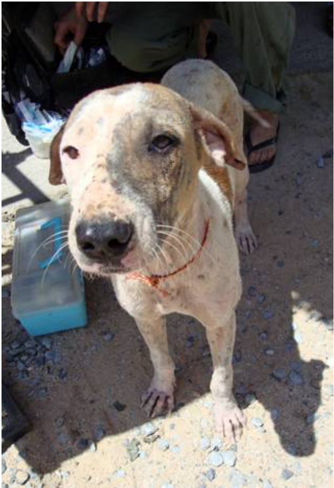
Buddy got lucky: 4 weeks after we started the treatment, she was adopted by an English couple living on the island ☺