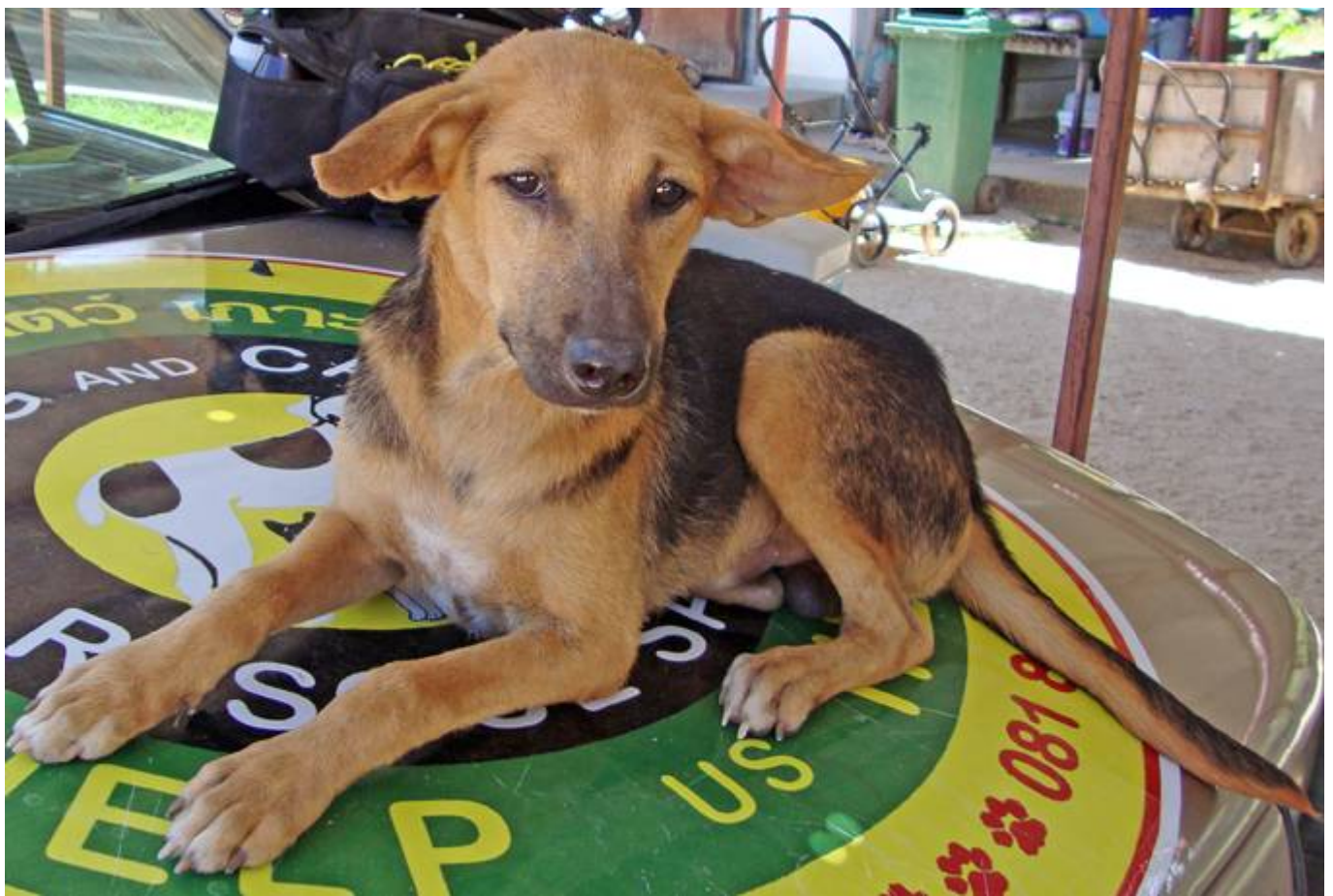
Looking nice and pretty and enjoying life at the Temple