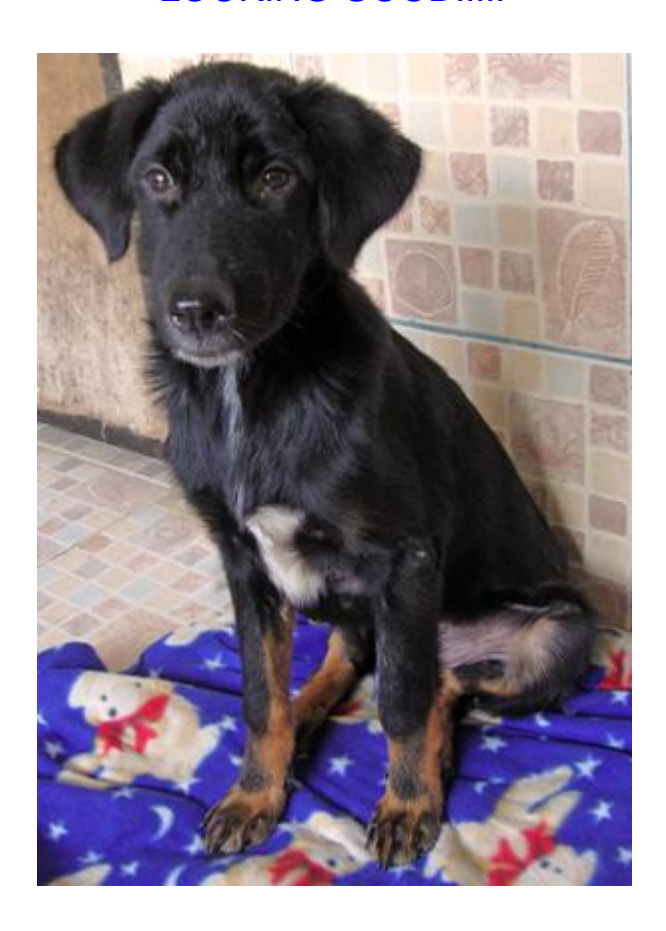
And this is Copperfield alias Copy!