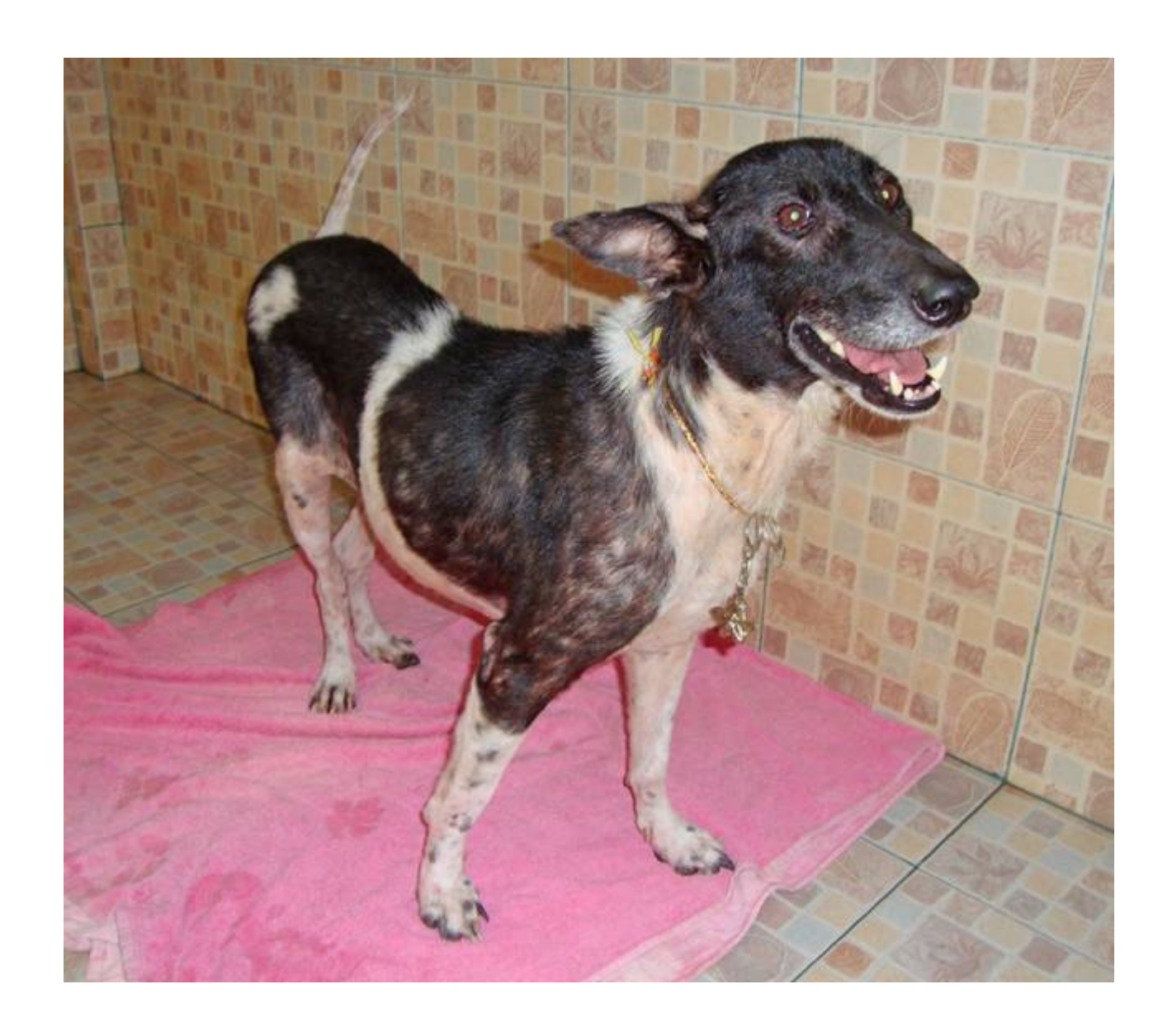
PRETTY PRETTY LADY ©