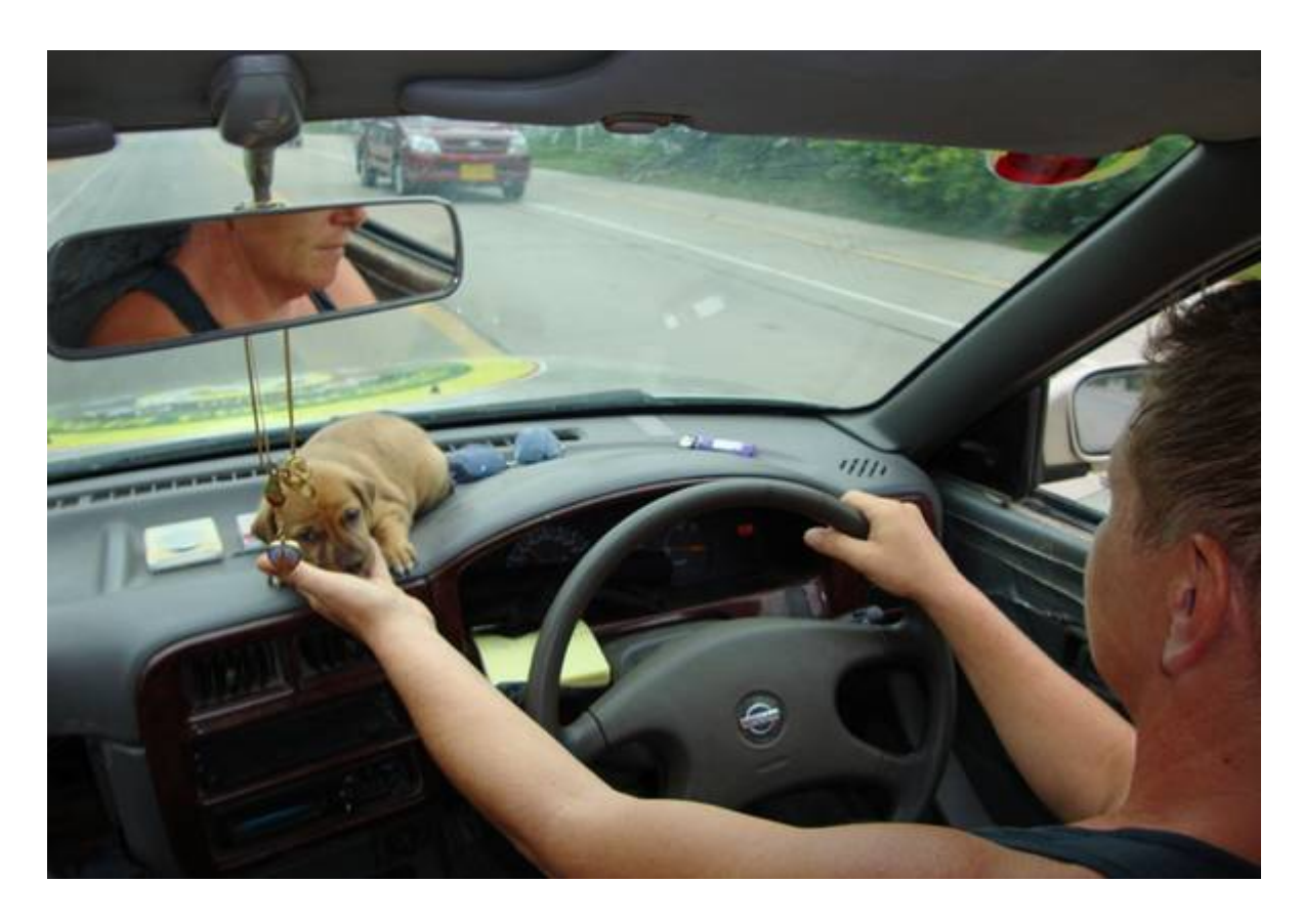
They loved it in the car!.....