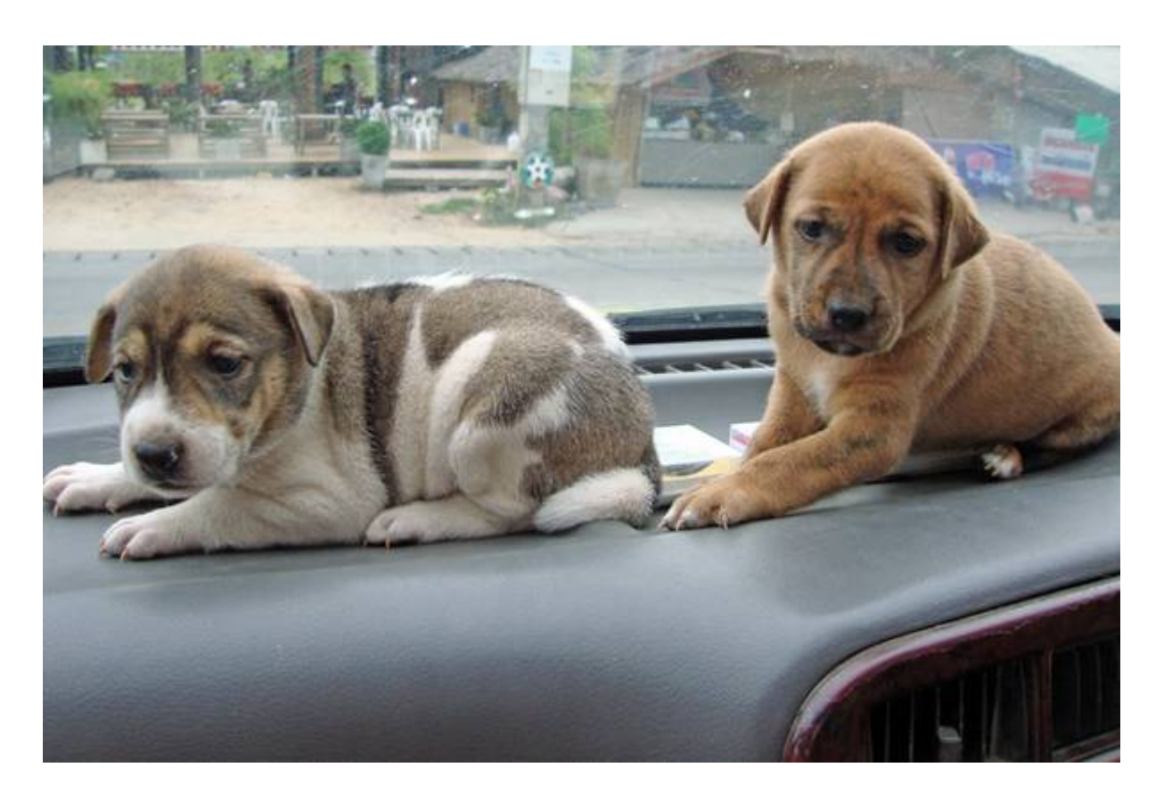
They got a nice warm room in the puppy house.....