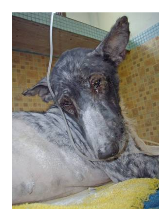
Thanks to the intense care of everyone involved in Copperfields case, she has managed to make an amazing recovery and is now on the fast track to becoming a healthy, happy dog.