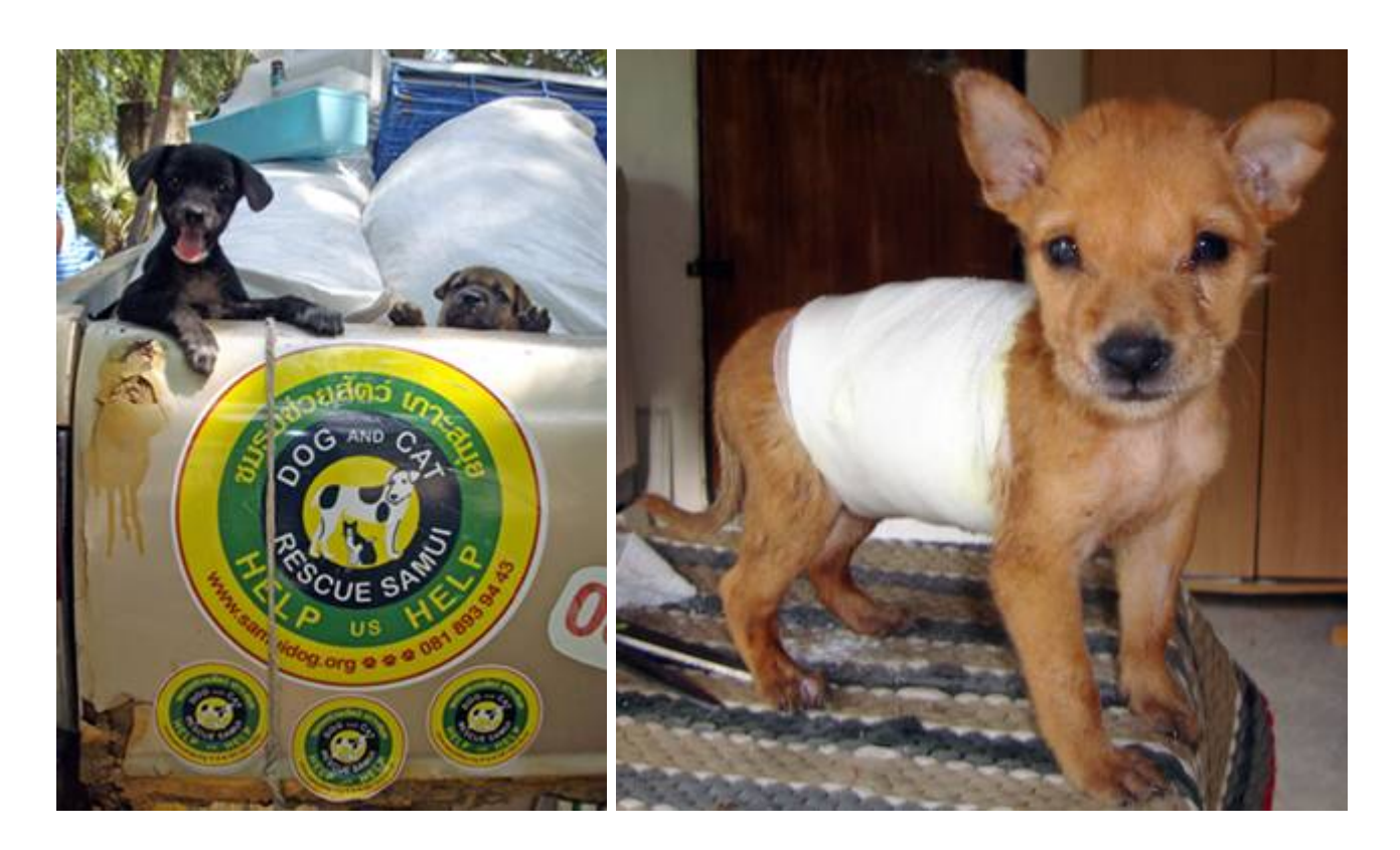
We currently deliver 700kg of dog food and 150kg of cat food to the temples every month