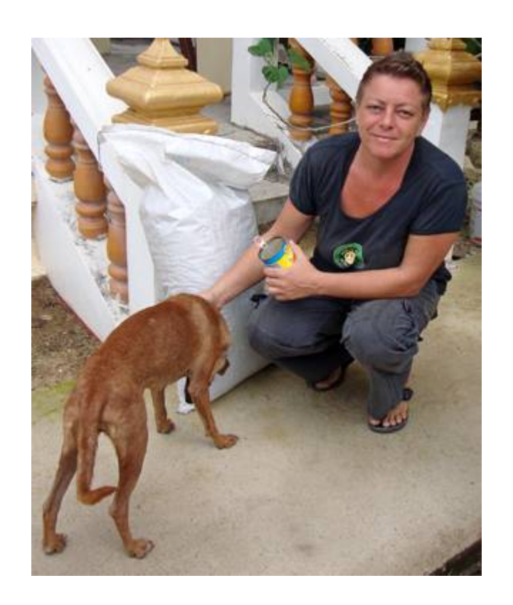
THANK YOU FOR YOUR SUPPORT!