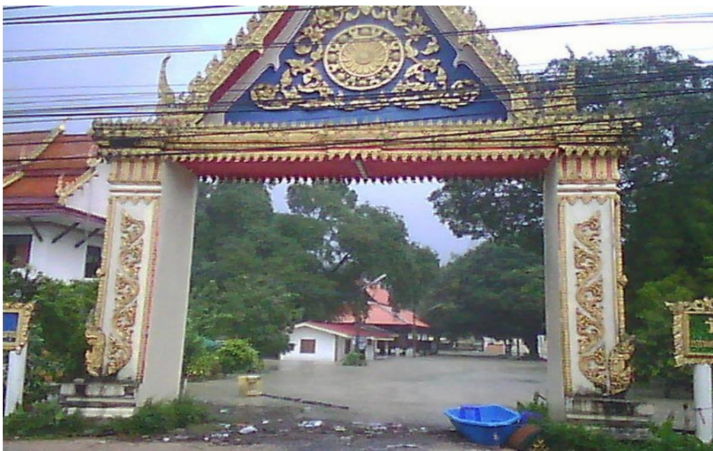
As you can see in the picture, some of the temples were only assessable by boat

The floods were very difficult for the temple dogs. We tried very hard to ensure they all remained safe but because many of the temples were completely under water a few of them left to try and find a drier place to stay. Unfortunately this ended tragically for some who were hit by passing cars. For those still unaccounted for, we hope they will find their way back home soon. On our first TemplerRun after the floods, we were not surprised to find an unusually high number of animals in need of help.