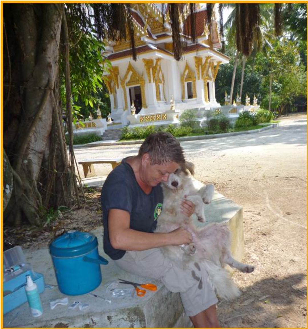
Cleaning wound on Fozzy...

Some pictures from the work at the Temples in the last 3 months: