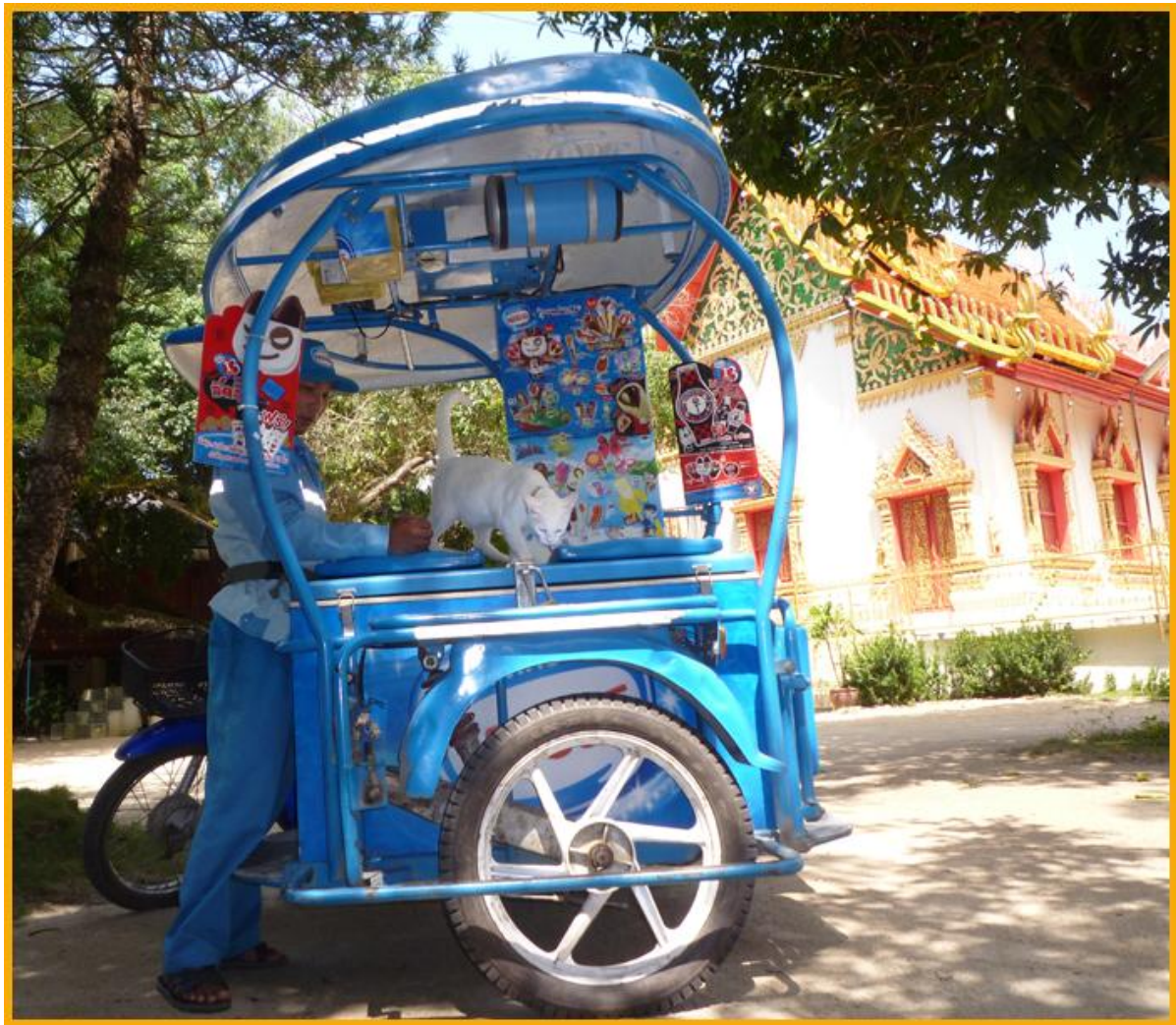
There Is Ice Cream Here Somewhere....