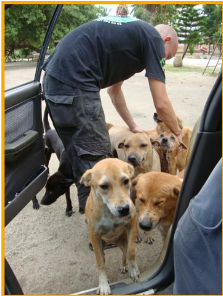
Everyone Loves The DogRescue Car