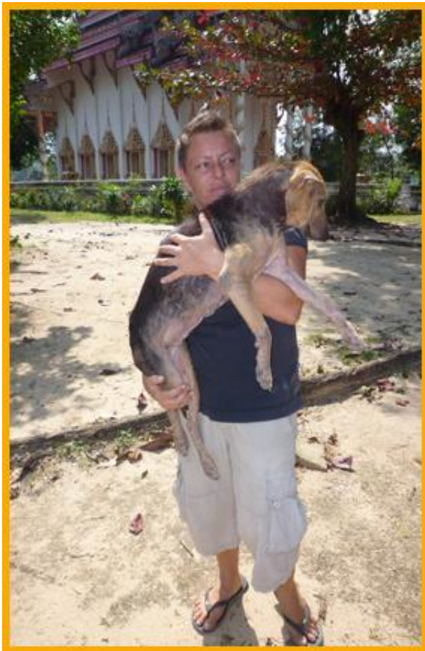
Time For Another Mange Injection