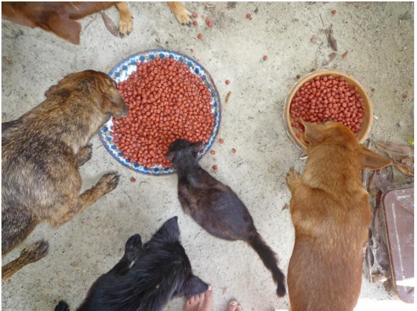
Dogs And Cats enjoying the newly delivered food