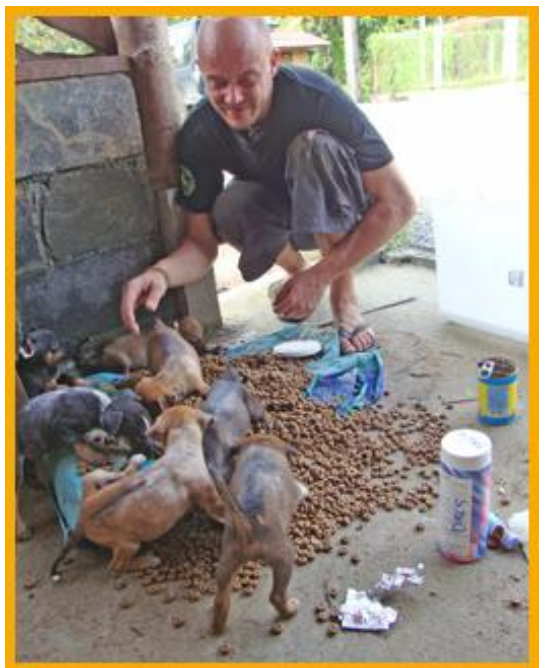
Do We Eat This, Or Play In It?.....Ok, We Eat It.....