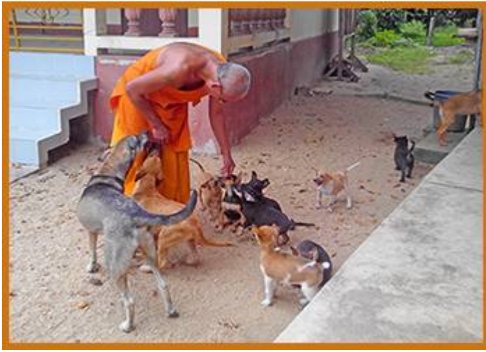
It's wonderful to see how caring some monks are with the animals