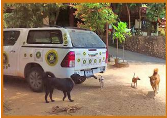
It didn't take long until the dogs trusted us

Please help to keep this very cost worthy project running by continuing to support us with your donations.