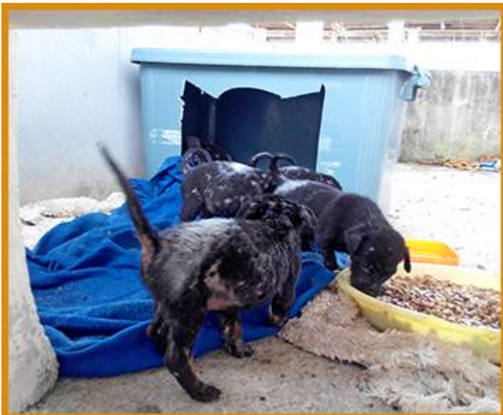
Due to the rainy season, we have set up some warm puppy-houses, where the little ones can find some shelter.....