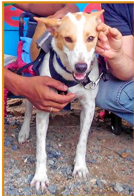
...Hardly a time when she doesn't smile