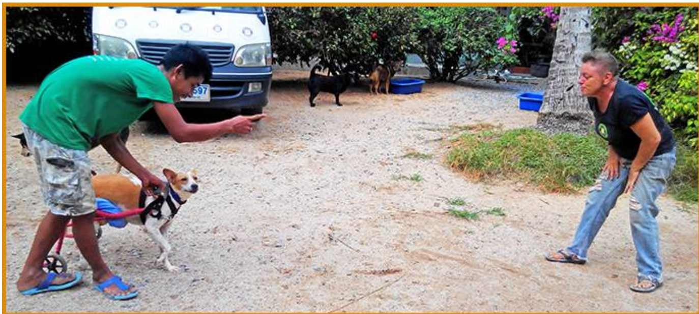
Maa can even run on sandy ground 😊