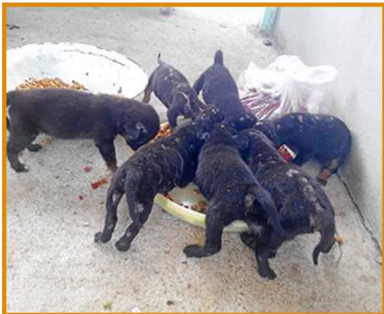
Many hungry mouths to feed....