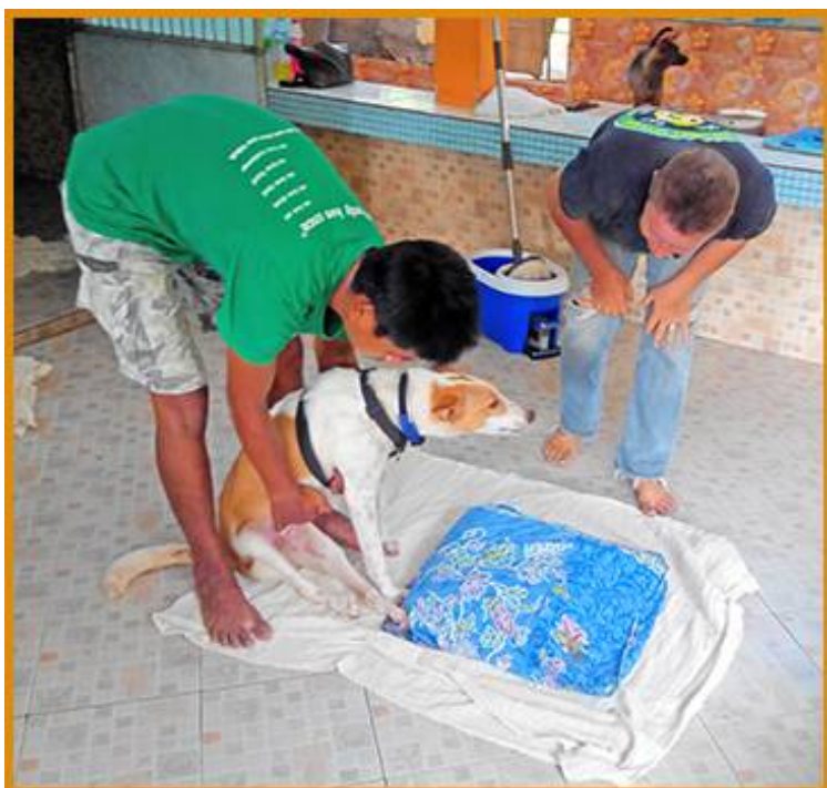
The fun is over and the daily training starts....