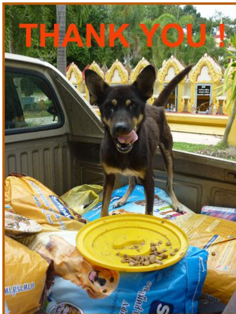
The Temple -Team