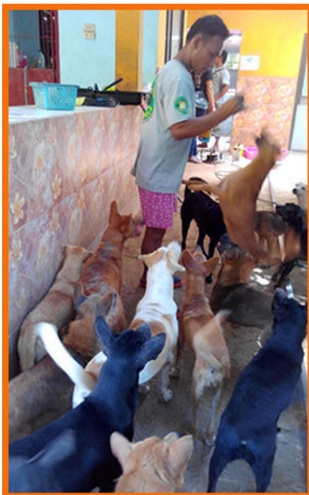
Au giving the daily medicine to the ones who need it...