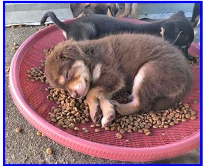
Tired and full, how wonderful