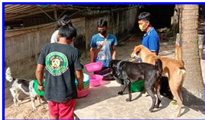
The dogs are already watching attentively as the food is distributed into the bowls.