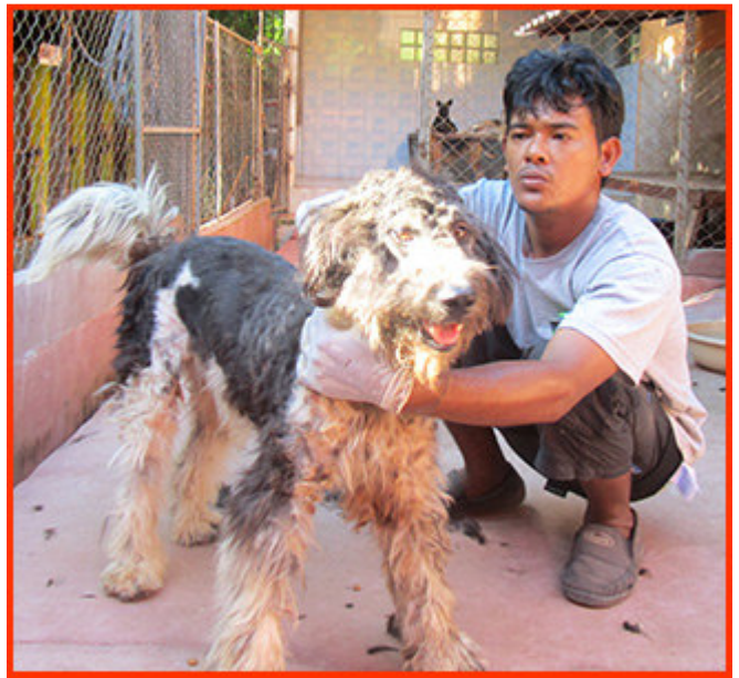
Here, the next two waiting for the grooming appointment at the barber.