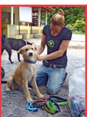
Please don't stop collecting old dog collars.

Though we have found a shop meanwhile where we can buy nice collars for 50 cent a piece, so that even all stray dogs coming to the shelter for neutering or treatment of their diseases will be provided with a collar - as long as our funds suffice!