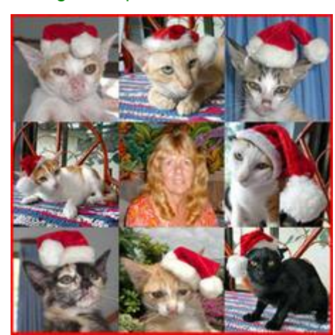
Please help us with your donations for the dogs and cats, who continually require food and medicine

http://www.samuidog.org/text3_english.htm