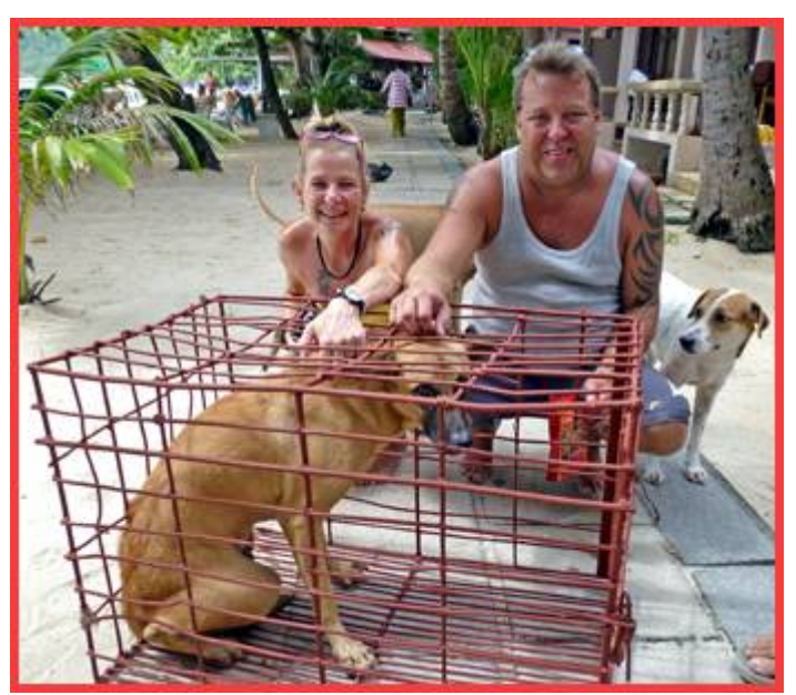
SIT will fly to Germany soon.