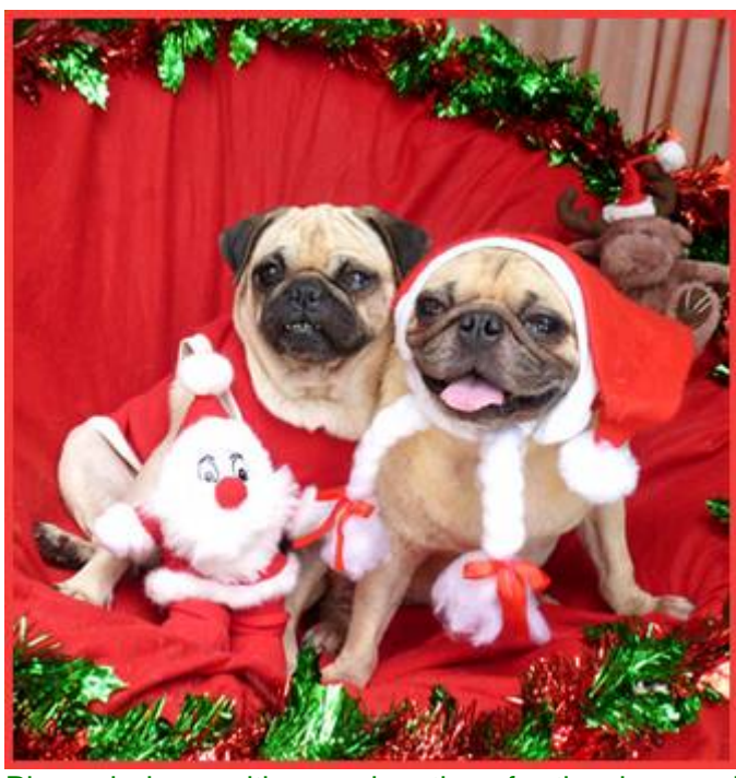
Please help us with your donations for the dogs and cats, who continually require food and medicine. HELP US HELP