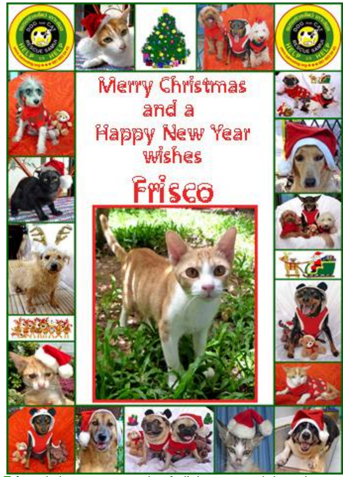
Frisco is just one example of all the cats and dogs that are looking for sponsorship.

For just 15 euro a month you could take over a sponsorship for one of our beloved.