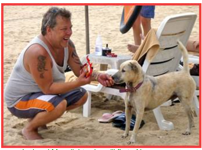
Jogi and Moonlight, who will fly to Norway soon.

But mind: Only feed on the beach or in the streets, never inside the hotel compound. Please take care to take your "pet" to beach and feed him or her there. Do not lure the dogs to follow you to the hotel: the next guest might complain and the manager will possibly order the dog to be poisoned.