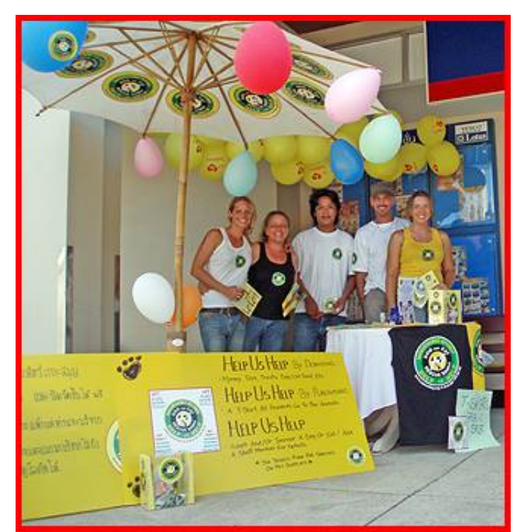
Our volunteer group did an advertising day outside one of the three big shopping centres on the island. Most of the donations came from Thai people – the foreigners didn't seem to be so interested in the project.