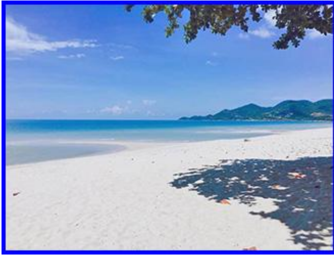
The Chaweng Beach in August 2020 In August we normally have high season here, packed full with Italian and French tourists

After the tourists were all gone, we had to think about what would become of the dogs on the beaches. So far, they have been looked after almost exclusively by tourists. I took over the feeding at Chaweng Beach. The dogs have all gathered on the stretch of beach at the public entrance. The Thais meet regularly on this stretch of beach to have a picnic. There is always something left for the dogs and just looked at me funny when I offered them the dry dog food. Shows how well fed the Chaweng Beach dogs are. There are very few dogs left on the beaches, and they are all well fed and look great.