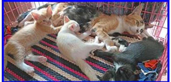
Mothers with babies have recently been brought to us more and more often.