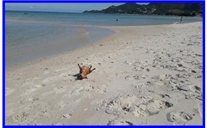
Gina-Lisa sunbathes in a comfortable supine position