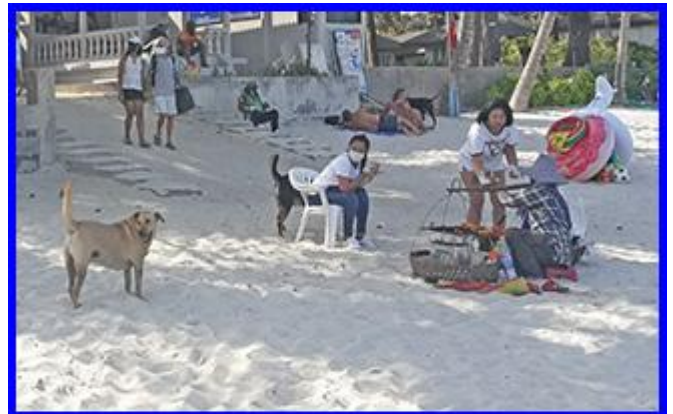
The chicken sellers are on the beach every day and the dogs like to be around them. The bones are ALWAYS the perfect left overs