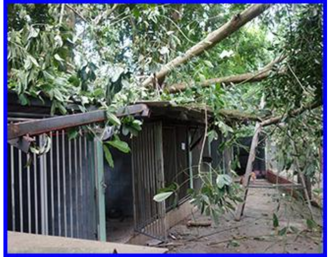
All the dogs got away with a fright. Fortunately, nobody was hurt