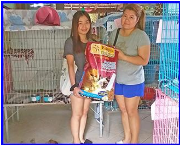
Apple and Pepsi with their food donation for our cats

The only question is when? Will we hold out until then without these donations? In the next few months, we will probably only depend on help and support from abroad. I can only hope and pray that you won't let us down. Nobody knows what we ALL still have to face. This uncertainty scares me. Every one of you is affected by this crisis. I wish you ALL that you get through this difficult time well.