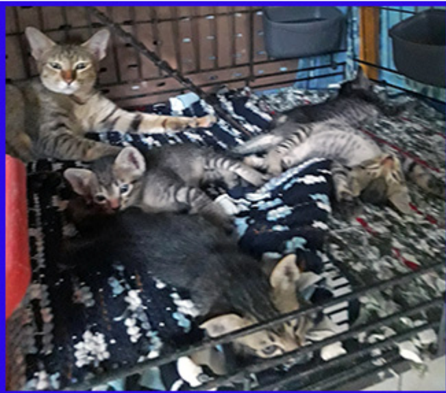
At the moment a lot of kittens come to us. Luckily, many come with their mothers: