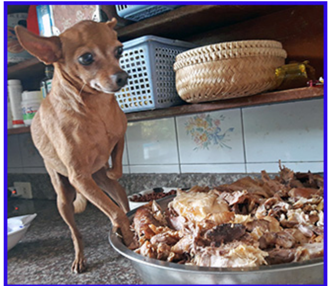
Gina-Lisa was a bit overwhelmed with the huge mountain of meat.