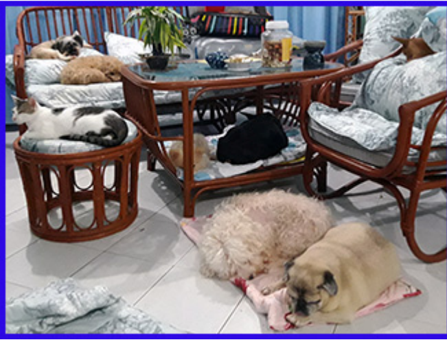
After the big party everyone was just tired