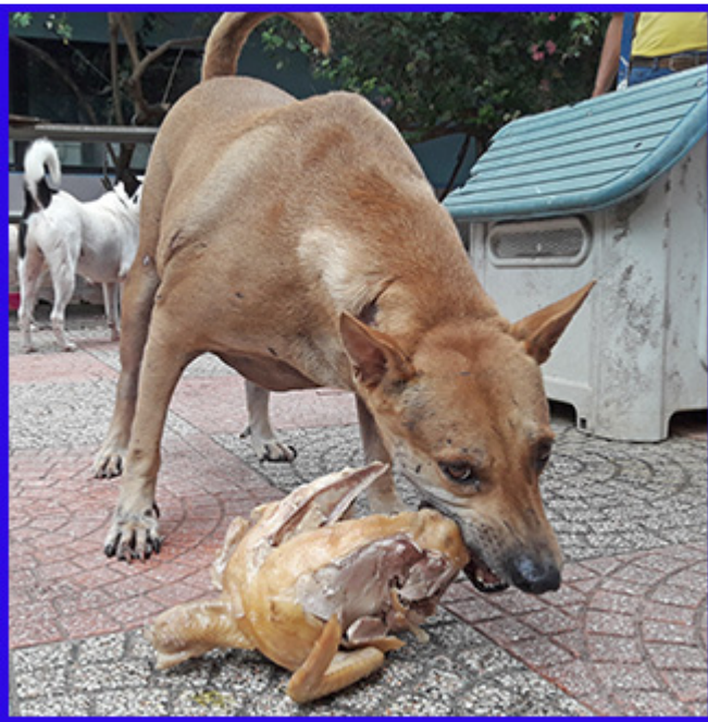
A day in land of milk and honey: For all at my house there was chicken as much as they wanted.