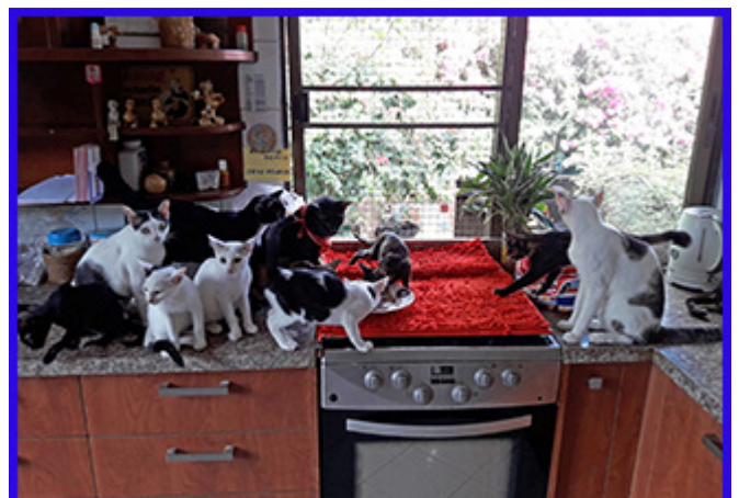
Predator feeding in the morning