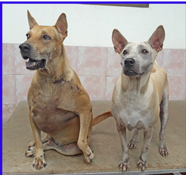
For chicken, they are all waiting in line.