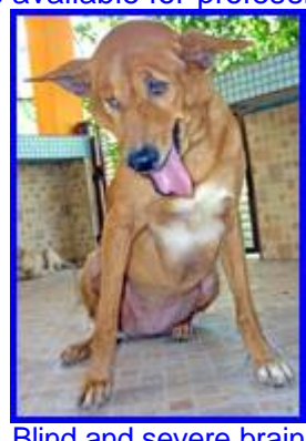
Blind and severe brain dysfunctions