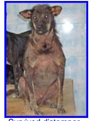
Survived distemper, has mange