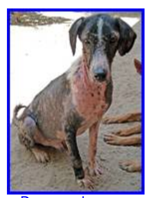
Depressed, severe Demodetic mange