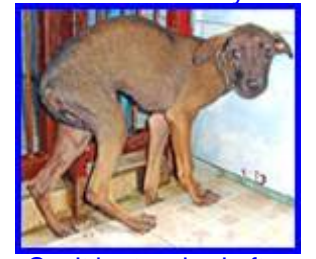
Can't be touched after being mistreated