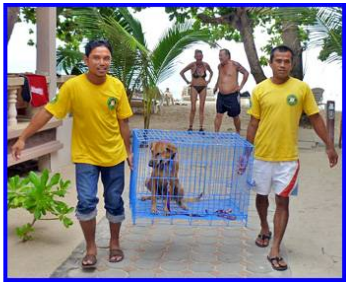
In June I had informed you about several cases of poisoning on Chaweng-Noi beach next to Fairhouse and First Bungalow.

http://www.samuidog.org/Rundbrief_PDF/Info%20June%202011%20englisch.pdf