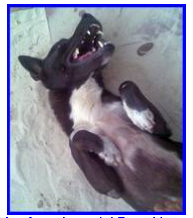
Max from Imperial Boat House