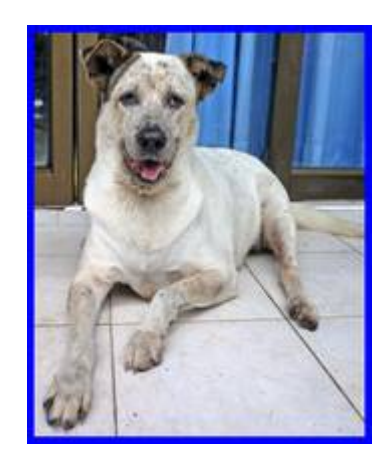
Egg from Chaweng Buri Resort

You can now find this years DRCS island-newsletters on our homepage. These newsletters are sent to many hotels, restaurants and businesses around the island. They also contain the operation statistics there and many other news about our work.