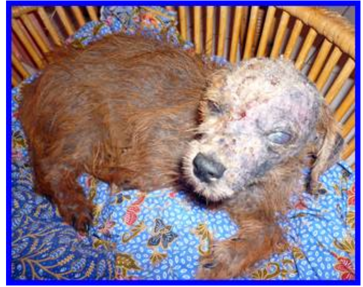
BLAUNI. You may see his whole picture story here: