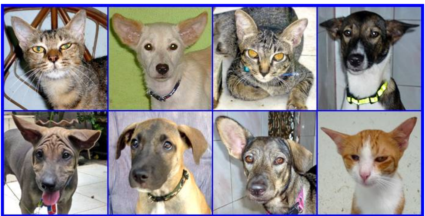
Info letter August 2010 - Page 1 of 8

Please inform me, if you want to help us. All these animals would like to fly with you...and there are 16 more still waiting for someone to accompany them!