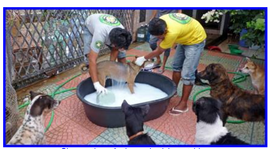
Shower time: And everybody's watching

The amount of ticks on the island depends very much on the season. July/August has been especially bad. All dogs in Chaweng got a Bayticol-Ticwash and the whole yard was washed out properly. The treatment did help but should be repeated constantly and unfortunately Bayticol is very expensive. At the shelter we operated with a lot of powder and puppies are constantly searched for ticks by our volunteers, not always a pleasant task.