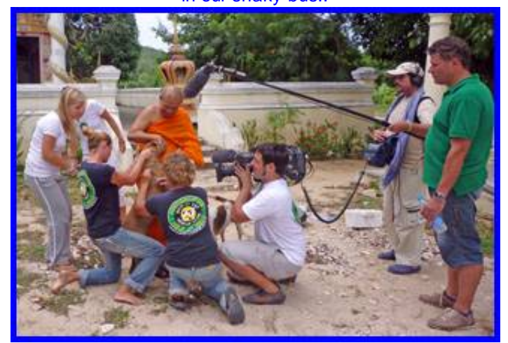
Vaccination of dogs at the temple in Bophut: The head monk leads the dog on its forepaws to its treatment and shows dedication in assisting during the vaccination.