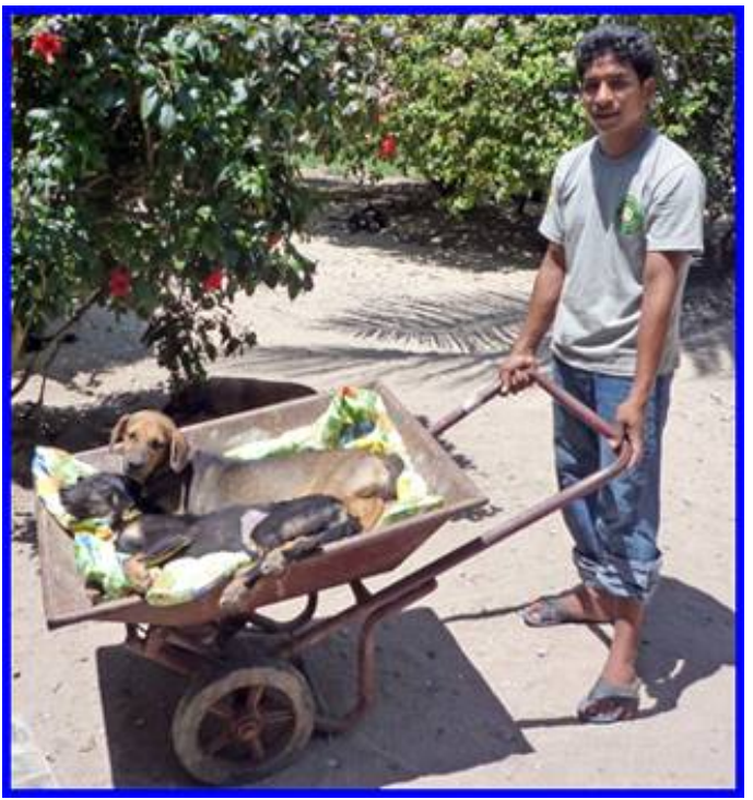
On the way to the box after the operation