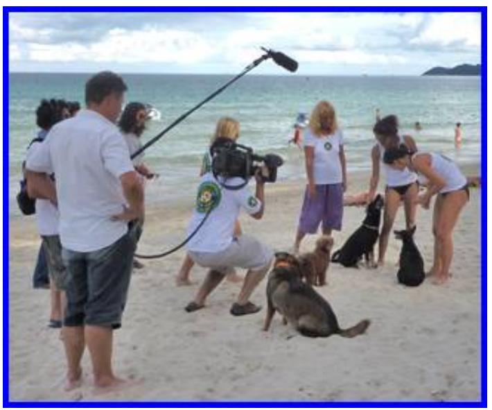
Dog vaccinations on Chaweng beach