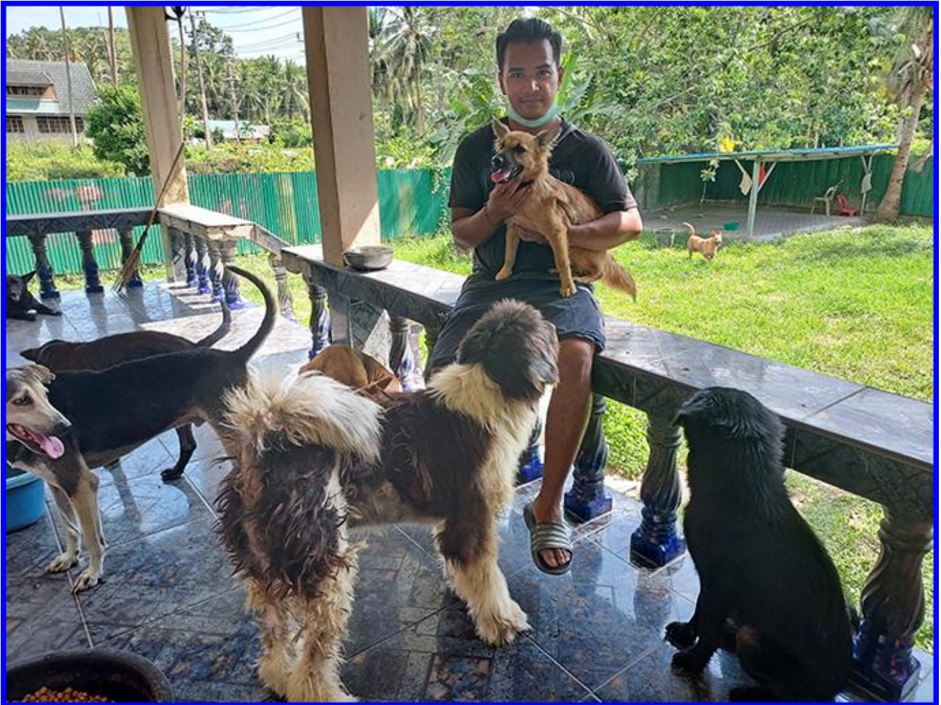
In the background, you can see the new dog house. Now only the “fence” has to be made really escape-proof somehow, then the dogs can move out of the completely overcrowded dog house.