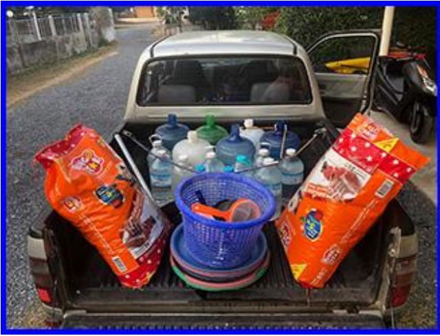
JULIA and ROD feed the dogs at the old pier.

Besides food, Julia and Rod have to take many liters of water to the pier every day. There are no hotels nearby where the dogs can normally find water in flower pots standing around. A day without food is certainly not so problematic, but without water? April and May are the hottest months and it almost never rains.