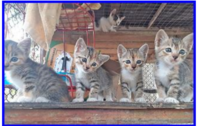
Many kittens at Wat Chang Nathon