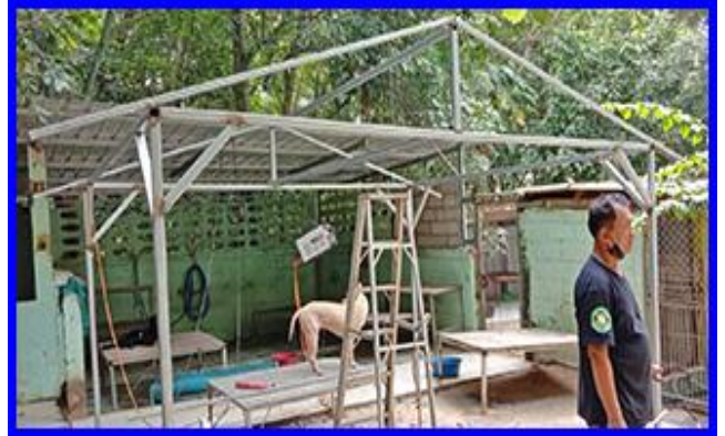
The animal shelter is over 7.000 m2 large. There are always repairs to be carried out on the doors of the dog boxes, on fences or roofs.