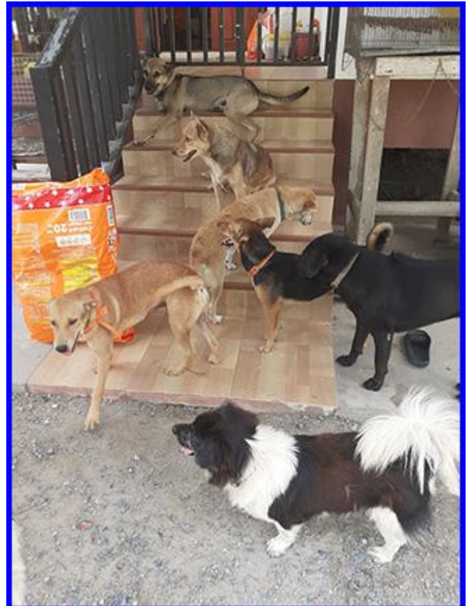
Garbage Village Lipa Noi