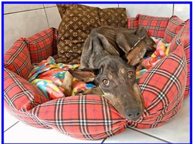
She clearly feels comfortable in her basket