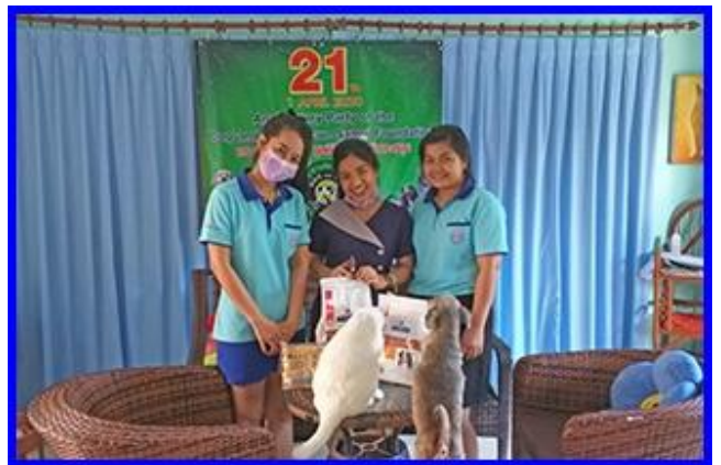
Feed donation from the Thai International Hospital