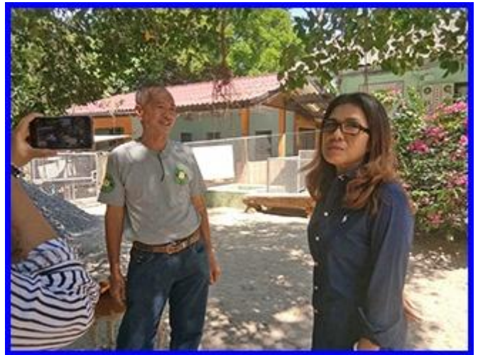
Donation from the Marriott Bonvoy