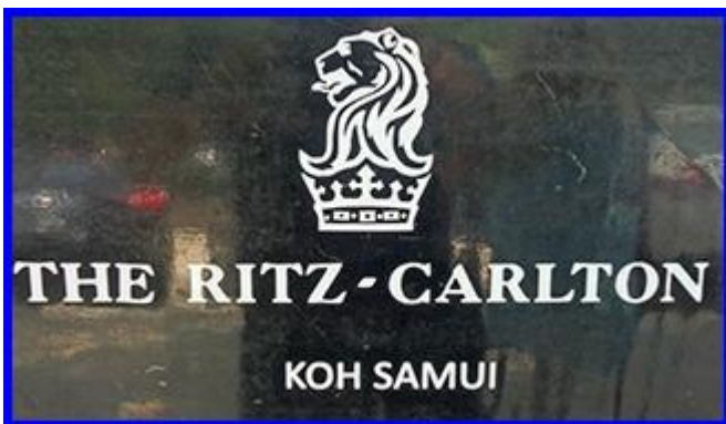
The Ritz - Carlton staff went on a company outing to our shelter and brought donations. Thank you so much!