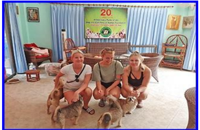
3 Sweedish Girls