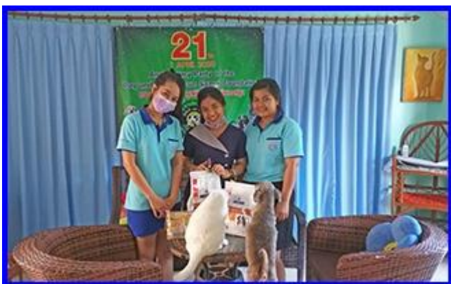
Feed donation from the Thai International Hospital