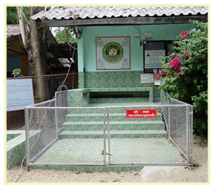
Entrance to the clinic– waiting area for the patients and their companions.