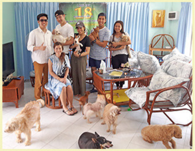
I guarantee you will have a lot of fun with our dogs and cats.