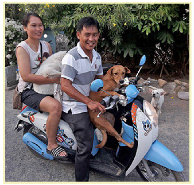
It is normal in Thailand to transport the dogs with the bike. We just have to pray and hope, the driver doesn't need to brake suddenly.