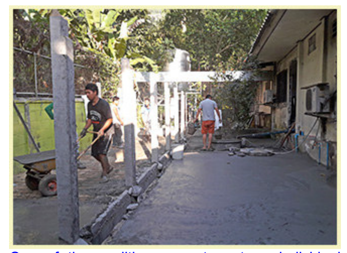
One of the conditions was to set up individual boxes that are separated from the rest of the shelter. We had a hardly-used cat terrain behind the clinic which turned out to be the perfect spot for those boxes. We added an access door for Dr. Sith from the operation room to the new boxes.