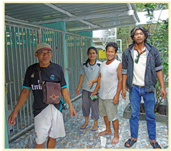
This is the small construction crew, who was able to do all the necessary work within the shortest time. They did a great job!