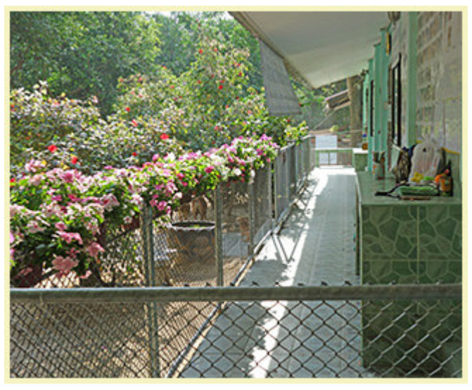
We have established the fence around the clinic to provide the dog-free area.