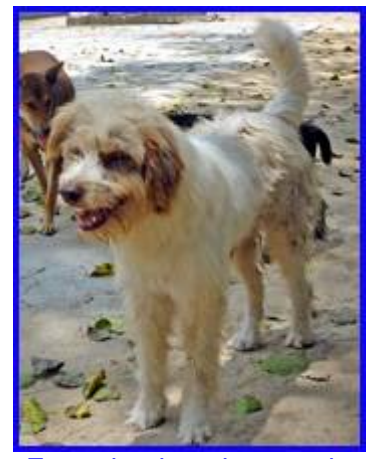
Fozzy back to the temple