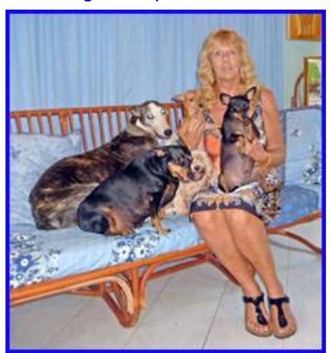
Please help us with your donations for the dogs and cats, who continually require food and medicine. HELP US HELP

http://www.samuidog.org/text3_english.htm