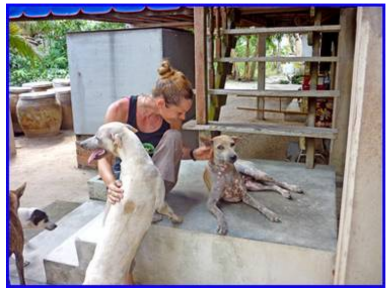
Miss Skinny's in her new home