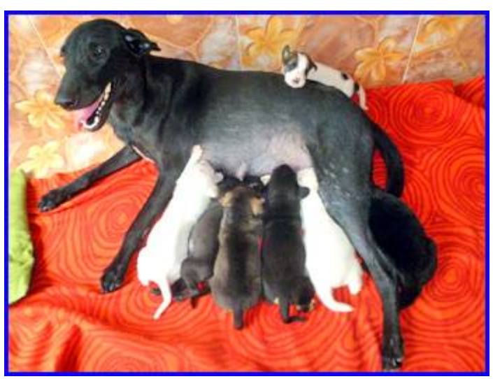
Info letter April 2013 - page 8 of 10