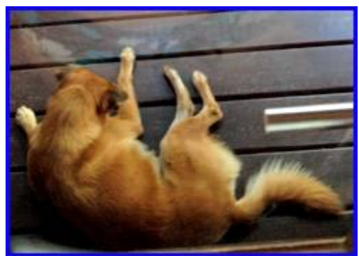
Where are the dogs? Still alive? If you are on holiday in Samui and see the dogs- please inform me!