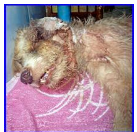
Fozzy arrived in the shelter

Of course there will always be cases the Team cannot treat on the spot and the animal has to come into the shelter for intense treatment and, like in Fozzy's case, daily wound cleaning and special attention. Whenever this is the case, the Temple-Team brings the animal into the puppy house where they can recover in one of the free rooms and enjoy some special attention by the many volunteers who have been doing mental wonders to some of the dogs at the shelter. Since the Temple-Team is also in charge for our puppy house, they