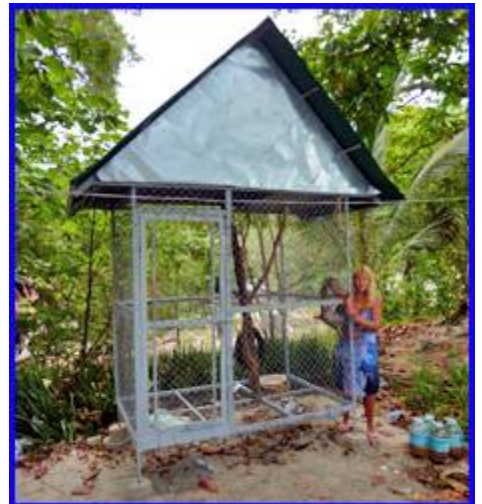
Ling is very fine in his new cage. A prisoner in "paradise". We look regularly after him.

Please do not take pictures with monkeys or other animals which are abused for tourist pictures in shopping streets or on the beaches.