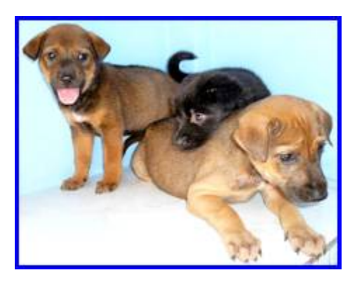
The younger the puppets are, the easier it is for us to find a new home for them on Koh Samui. Of course they must be healthy. White dogs are the easiest to be placed.