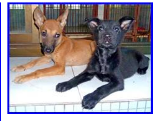
This is the typical Koh Samui dog. We have either got the black "model" which is unfortunately not at all appreciated by Thais, or the highly representative and numerous brown Koh Samui dog.