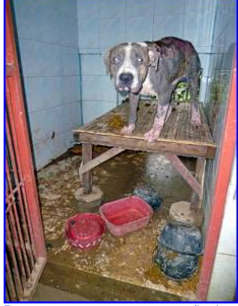
Buu , our permanent care case (he has caused a lot of open wounds by mange), was happy when he finally was allowed in the garden again.