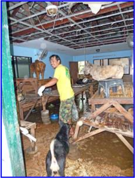
Fortunately, the ceiling came down during a power failure! I hope we don't have to clean everything soon again.