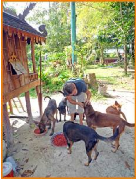
Linda checks the gums of the dogs: if the gums don't look pink and pretty, it may be an indication for a blood parasite requiring immediate treatment.